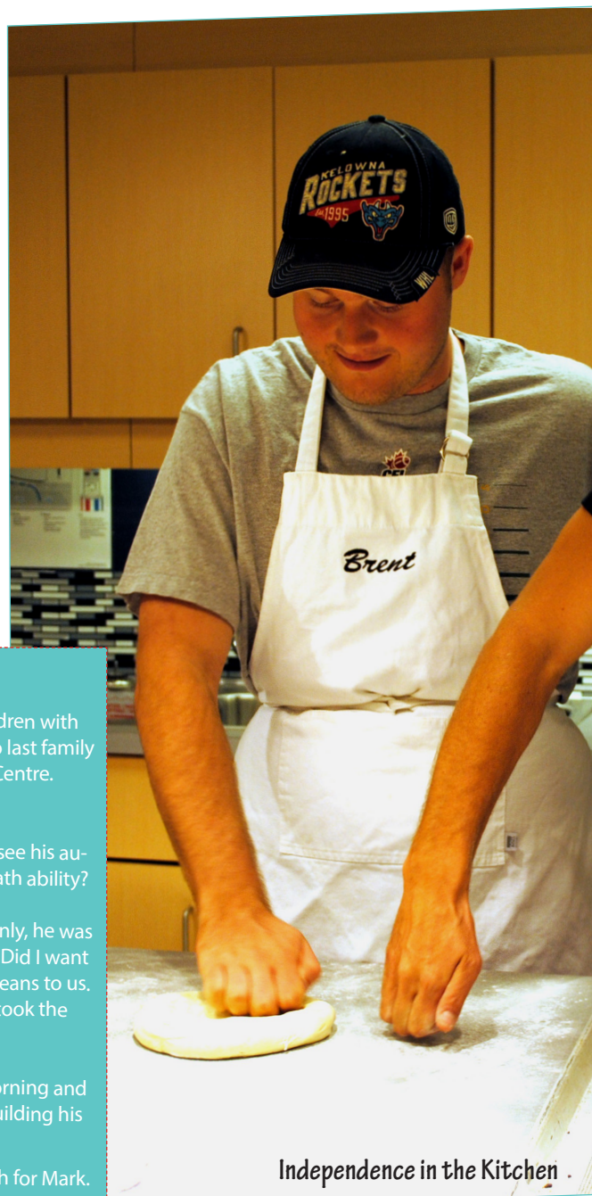
Independence in the Kitchen

And this year, the Centre added two new programs designed to fundamentally alter the future for young people with autism in Canada - CommunityWorks Canada ®, a pre-employment program for high school students and Quest for Independence , the first post-secondary independence program for young adults in our city.