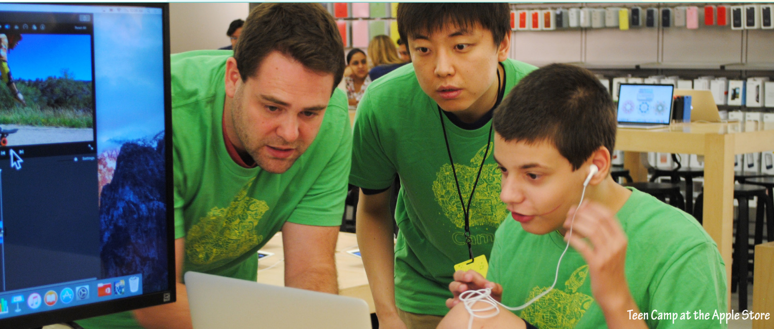
Teen Camp at the Apple Store

Our visual arts programs for children, teens, and young adults continue to be among our most popular offerings. This year we held our most successful art show and sale, garnering the attention of two Edmonton television stations.