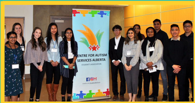
The CFASA Students' Association at the Discovering Autism Conference